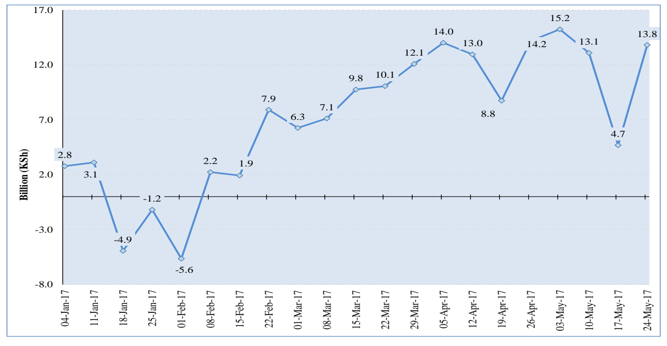
CHART A: COMMERCIAL BANKS EXCESS RESERVES